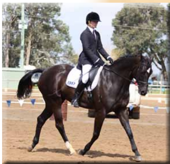
Below: Excelsior Onyx and Owen Ottawa competed in Official Preliminary and Novice.