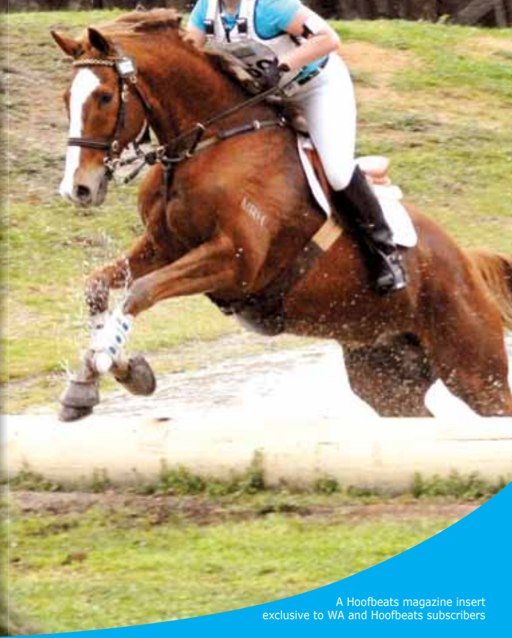
A Hoofbeats magazine insert exclusive to WA and Hoofbeats subscribers